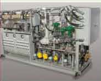
Fuel Oil/Water Injection System

We are a division of Braden Manufacturing, LLC, which has been a world leader in the supply of ancillary equipment for gas turbine applications for over 40 years. Consolidated Fabricators, like Braden, is a Global Power Equipment Group Company.