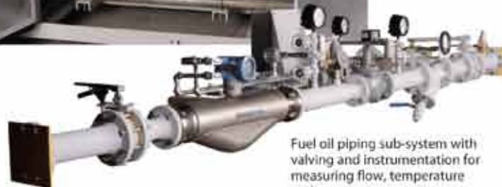
Fuel oil piping sub-system with valving and instrumentation for measuring flow, temperature and pressure.