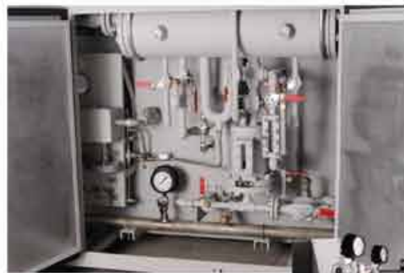
Fluid system sub assemblies with piping, vessels and instruments.

We provide one stop shopping for equipment that requires multiple disciplines of fabrication, machining, surface treatments, component integration, piping, vessels and testing.