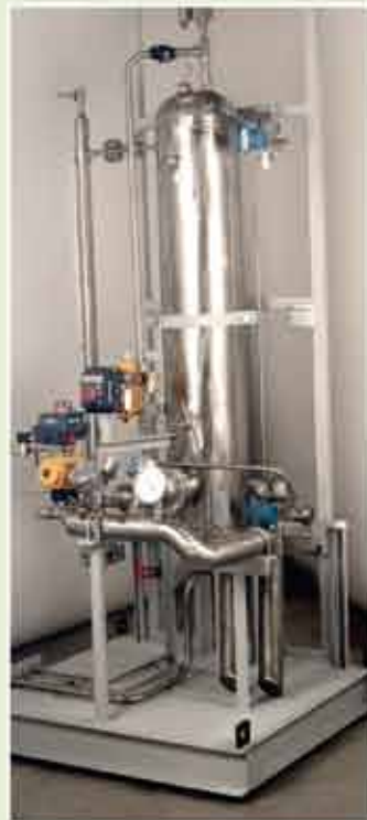
Liquid Fuel Skid