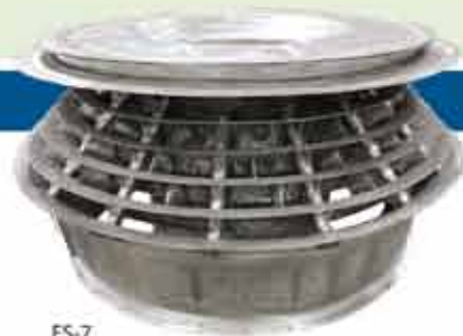
FS-7 Exhaust Diffuser