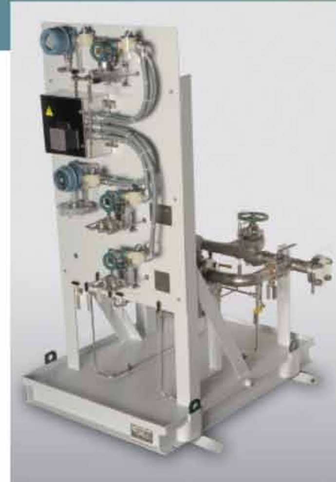
Seal Oil Skid