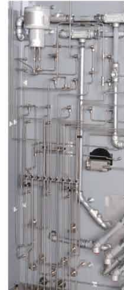
Hydrogen Monitoring Panel