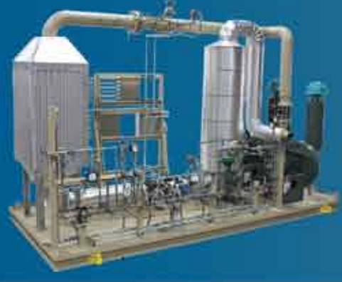
Ammonia Evaporation Skid