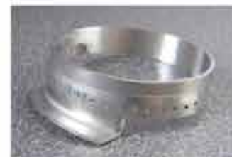
High temperature alloy collar (Haynes Alloy 25).

Consolidated Fabricators™ ("ConFab™") specializes in the design and manufacture of complex mechanical, electrical and fluid systems, such as Fuel Oil, Fuel Gas, Lube Oil, Water and Air handling systems. We make fabrications such as bases, diffusers and plenums as well as small high alloy parts such as seals, shims and brackets.